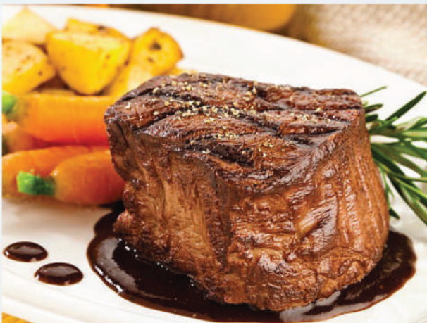
Signature Tenderloin 610.- Imported Australia beef 200 g