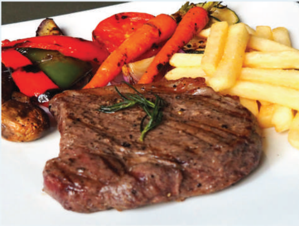
Sirloin 350.- Pure beef 250 g