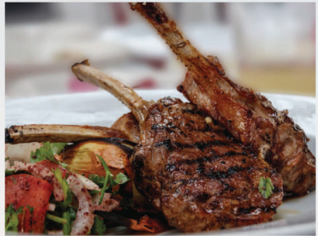
Lamb Cutlets 550.- Imported Australia Lamb

BBQ Pork Ribs 330.- with grilled corn and cajun potato wadges with Tex Mex condiments