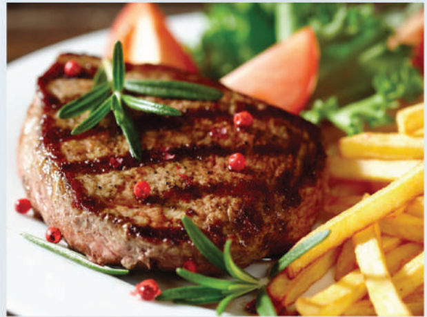
Rib Eye 650.- Imported Australia beef 220 g